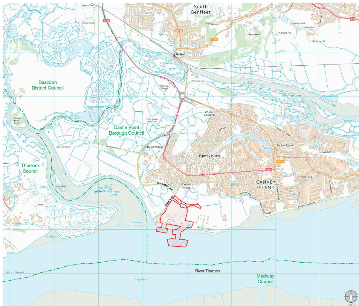
Figure 1: Location and likely boundary area of the OMSSD project